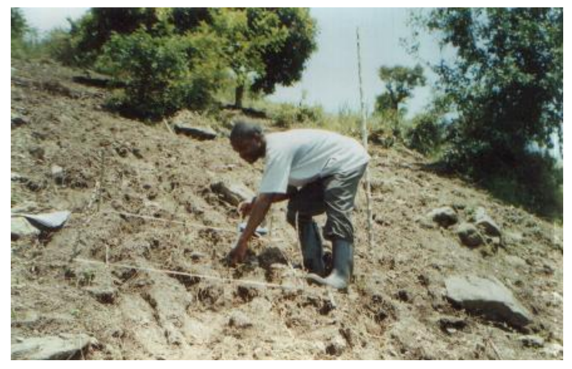
Plate 2. Measurements of the dimensions of the rills over a micro plot drawn on a freshly cultivated severely eroded cassava farm plot on the Muramba upper slope. The terrace is far below and was not captured.

Generally the results in Table 4 show mean rill depth values ranging from 0.10-0.21 m, mean rill width values between 0.11-0.21m and mean rill length values of 0.65 to 0.88m. Muramba and Bulindiguru registered the highest erosion rates with Muramba registering a mean rill depth and width of 0.21m and 0.20 m, a mean rill length of 0.88 m and an average rill number of 3.3 rills per square meter. Bulindiguru registered 0.20 m and 0.19 m as mean rill depth and width, 0.76 m as mean rill length and an average rill number of 3.3 rills per square meter. Ndugutu had a mean rill depth and width of 0.19m and 0.16m respectively, a mean rill length of 0.83 m and an average rill number of 3.3 rills per square meter.