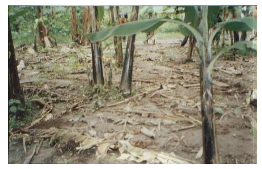
Plate 5. Sheet erosion caused by run-off sweeping mulches over a thinly mulched Banana farm plot on the Bulindiguru lower slope.

Over the farm plots where mulching is practiced, the mulching materials were found to be inefficient in controlling rain splash erosion and checking the speed of run-off to prevent rill and sheet erosion. As seen from Table 7, mulch depth values over the Bugoye farm plots are low and the mulches were found to be scattered on the farm plots leaving out portions of land unprotected from raindrop effect and offering little residence to high velocity run-off which sometimes sweeps the mulches down slope causing sheet erosion (Plate 5). The inefficiency of the mulching practice in controlling erosion is aggravated by the fact that it is in most cases the only conservation practice on the farm plot, yet it is recommended that mulching be used together with physical structures as water diversion channels, terraces to check the speed of run-off.