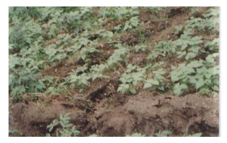
Plate 3. Severe erosion caused high velocity runoff flowing over submerged trash bund over a beans- cassava garden on the Nyakajoro middle slope. (One of the submerged bunds can be seen in the fore found)

As already noted, trash bunds in Bugoye are temporary structures that are destroyed every ploughing season and later reconstructed in the following season. It was observed that trash bunds common over the steeper middle and upper slopes are capable of trapping small amounts of soil and checking the