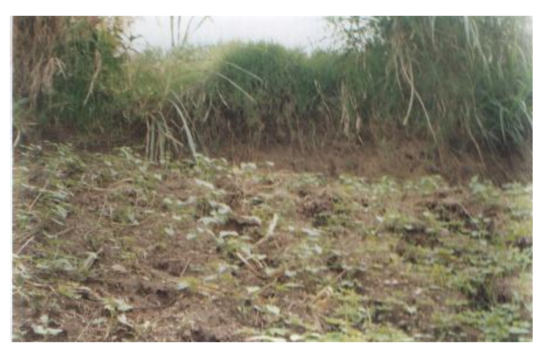
Plate 1. Severe rill erosion over a Beans farm plot caused by high velocity runoff flowing over the Steep lower terrace end on the Kibirizi middle slope.

The presence of poorly maintained terraces has indeed aggravated erosion problems on some Bugoye farm plots. Plate 1 above shows a poorly maintained modified bench terrace with over grown grass on a beans farm plot. As seen in the photograph, the lower terrace end has been over steepened by both cultivation and high velocity runoff and as such the steep slope created accelerates the speed of runoff increasing its erosive power leading to the development of large and deep rills and thus massive loss of soil and destruction of crops.