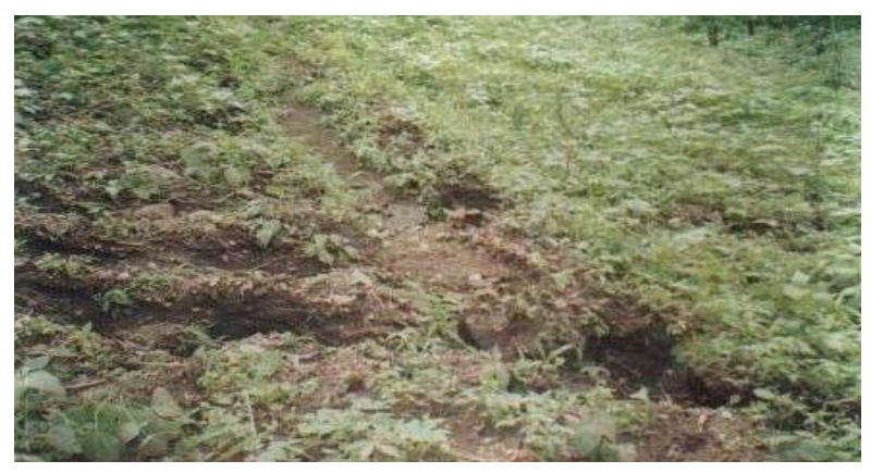
Plate 4. An over silted water diversion channel initiating severe rill erosion down slope in a Beans-garden on the Kvikubangali lower slope.

facilitating channel silting and over spills aggravating the soil erosion problem (See Plate 4). The wide spacing between the diversion channels also leaves land between the channels prone to severe erosion. Some channels were also found to have been filled up with sediment and therefore, no longer operational as conservation structures.