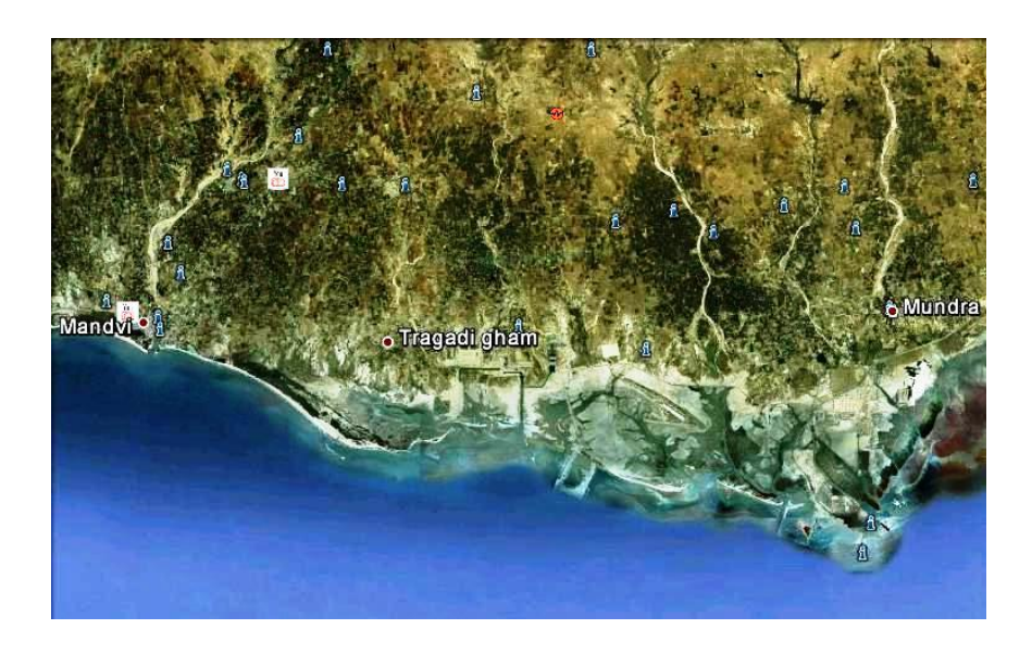
Figure 3. Sketch map showing lineament and structural control on the development of coast on Mandvi to Mundra Segment (modified after Google Earth).