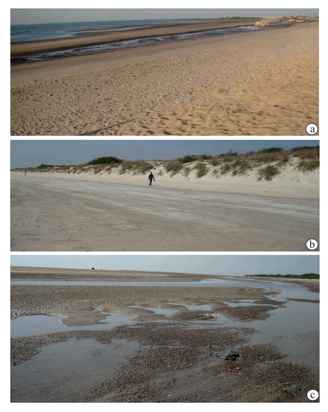
Plate 2. Mandvi to Mundra segment (a). Ridge and runnel system. (b). Coastal dunes and tidal flat. (c). Beach, ridge-runnel with antidunes.

topography, but also accentuated the structural pattern. Each uplifted segment is generally bounded by a fault or sharp monoclinal flexures along its northern edge at a gentle dip slope in the south, creating in the process typical cuesta topography. Movements along N-S structural high in the basement that cut across the E-W structural trend and is called median high considerably influenced the structure, facies and sediment thickness to the east and west of it [4], which also influences coastal geomorphology much more and inscribed its signature on coastal features.