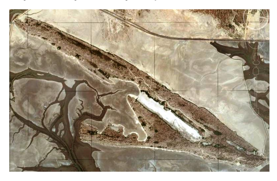
Figure 2. Phases of development of Mundra dune along Navinal coast in Mandvi-Mundra segment.

parallel dunal ridges. Length of the recent beach with raised beach is \sim 7 km. The lagoon in between first and second phase of beach-dune complex must have been filled later on to give rise to tidal flats. All such characters are indicative of continual upheaval of the coast since last 2000 years. Exact dates of different phases of upheaval are required for in depth study.