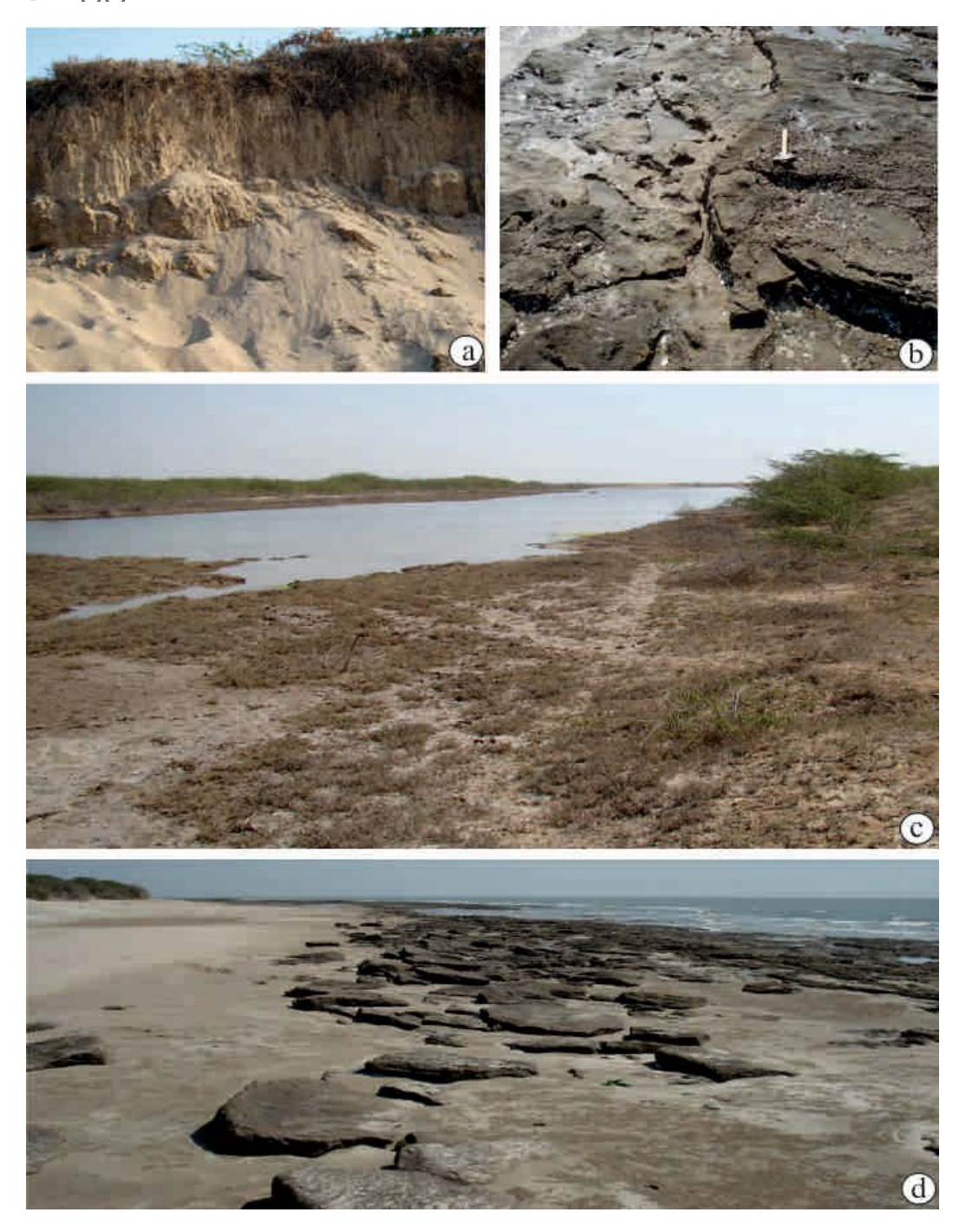
Plate 3. Mandvi to Mundra segment (a). Raised beach. (b). Displacement along fractures at Modava spit showing tectonic activity. (c). Tidal creek behind Modava Spit. (d). Exposures of hard rock (wave cut platform) and tidal flat at Modava spit.

It also appears to have influenced the broad morphological pattern on both its sides including coast, acting as a hinge zone and uplifting the eastern part of the basin and simultaneously down tilting the western part [1][2].